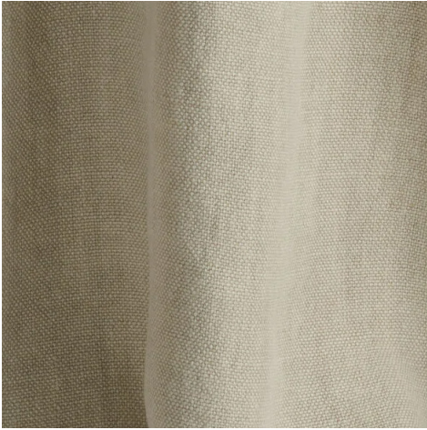
CHEYENNE - LINEN - PIERRE FREY The full range of colors is available